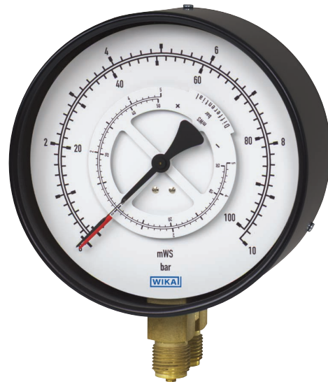
Differential pressure gauge model 711.12